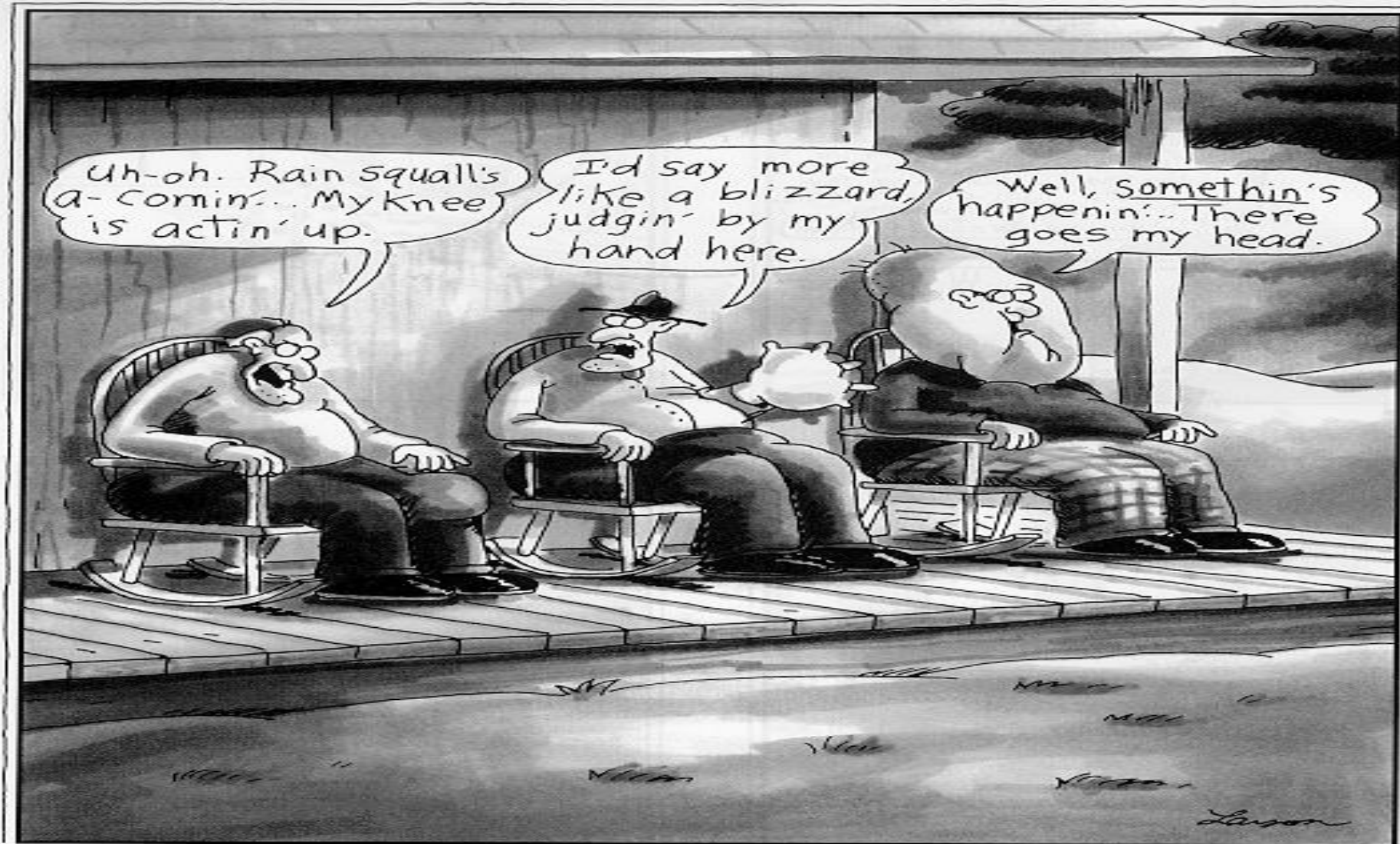
Front porch forecasters